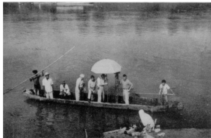
River crossing leveling operation in Colombia. Trabajos de nivelación cruzando un río en Colombia.