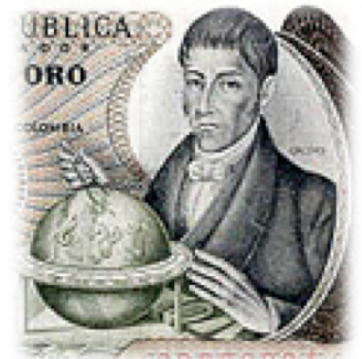
Francisco José de Caldas y Tenorio 1768 - 1816