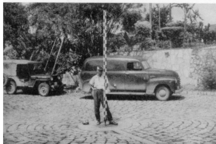
Leveling to a picture control point in Colombia. Trabajos de nivelación hasta punto de control fotográfico en Colombia.