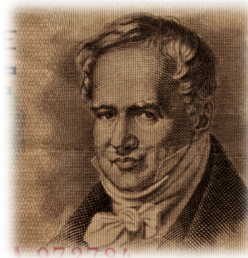
Friedrich Heinrich Alexander Barón de Humboldt 1769 - 1859