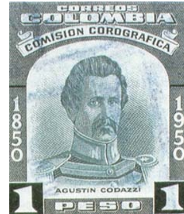
Agostino Codazzi Bartoloti 1793 - 1859