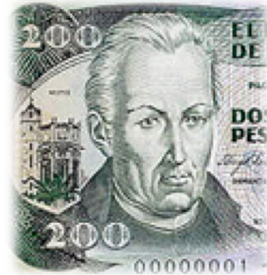
José celestino Mutis 1732 - 1808

• Humboldt was a very positive influence in the measurement and discovery of present Colombian territories.